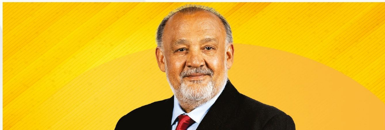
BRAND AMBASSADOR "ALOK NATH"

RESIDENTIAL | HOSPITALITY | HOTELS | BANQUETS | COMMERCIAL